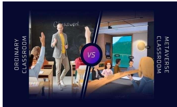
Fig.2. Ordinary Vs Meta Classroom ([11],[12])

Traditional education refers to educational systems that typically involve a physical classroom, teacher, and students, who meet in person to learn. This type of education has been the norm for many years and is still widely used today.