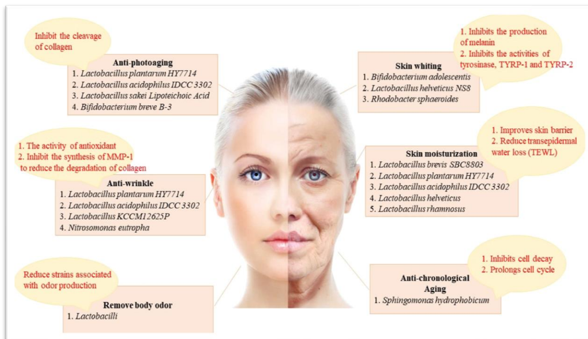
Figure 1: The skin improvement effect of probiotics and its related mechanism