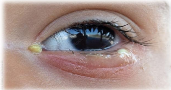
Fig. 2 Bacterial conjunctivitis

Bacteria such as Staphylococcus, Streptococcus and Haemophilus are responsible for this conjunctivitis, which is highly contagious and spreads easily, especially in children. All broad-spectrum ophthalmic antibiotics are effective in treating conjunctivitis, and there does not appear to be a difference between antibiotics in treatment success. Factors influencing antibiotic choice include local availability, patient allergies, resistance patterns, and cost. Many studies on conjunctivitis have shown that approximately 90% of affected individuals may experience symptoms of sticky and itchy eyelids; These findings are followed by lesser signs and symptoms, such as purulent discharge and burning eyes. Haemophilus influenzae conjunctivitis may be associated with otitis media and upper respiratory tract infections. More than 60% of patients feel the same for a week or two, and serious complications are rare. Conjunctival diseases, especially in conditions associated with corneal epithelial defects such as dry eye, place patients at higher risk for corneal inflammation. Although antibiotics can prolong the duration of the disease, neither outcome is different from treatment.