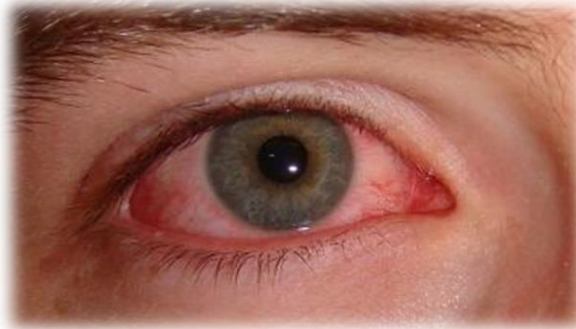
Fig.1 Viral Conjunctivitis