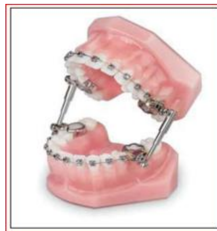
Figure 3: Parts of Advansync: Lumens are 16% larger with radiused internal edges for increased lateral movement