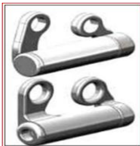
Figure 2: Advansync Appliance

Many design variations of the Herbst appliance have been invented over past 50 years. Advansync appliance is a recent modification of the Herbst appliance, also known as Molar to Molar appliance. AdvanSync was developed by Terry and Bill Dischinger in 2008 in conjunction with Ormco TM for treating skeletal class II malocclusion. 13 The appliance was designed to advance the mandible to class I occlusion within 6–9 months, while allowing simultaneous use of fixed orthodontic appliances. The appliance is almost half the size of the MiniScope Herbst appliance that has been in use. Because of the smaller size, it fits more comfortably in the posterior of the mouth. The sores problem with previous Herbst appliances in the lower premolar area from the screw housings, was eliminated in this design. The small sized appliance is not apparent in the mouth like previous Herbst designs, so is more acceptable to patients. A bonus that came out of the smaller design was the ability to bracket every tooth forward of the appliance. The AdvanSync is a fixed tooth-born functional appliance consisting of crowns cemented on maxillary and mandibular permanent first molars, a position where orthopaedic forces are applied. The AdvanSync shows more headgear effect but less mandibular length enhancement. 14