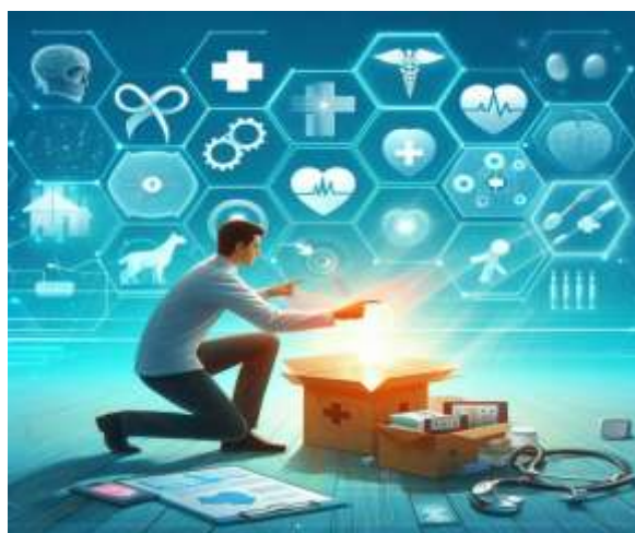
Fig 3: Feasibility

4. Social Feasibility: AI-driven healthcare solutions enhance accessibility, particularly in remote and underserved areas, by enabling telemedicine and remote diagnostics. AI applications for stress management, emergency response, and women's safety increase public trust and acceptance of smart healthcare technologies. Continuous awareness programs and user education can help overcome resistance to AI adoption, ensuring a smooth transition into AI-powered healthcare systems [2].