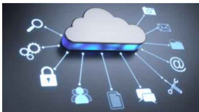
Fig 6: Cloud Computing