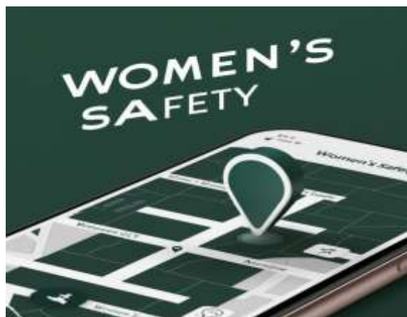
Fig 5: Women Safety

3. Automated Alert: If a critical situation is detected, AI systems can directly alert to the emergency contacts, ensuring immediate assistance.