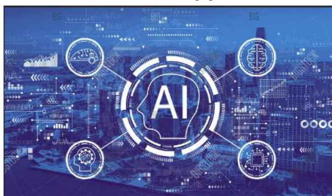
Fig 7: Artificial Intelligence

The future of AI in healthcare aims to enhance personalization and accessibility. Advancements in AI algorithms will allow for more precise disease prediction and treatment recommendations. AI-powered robotic surgeries and virtual healthcare assistants are expected to redefine patient care, making medical services more efficient and widespread. Additionally, the integration of AI with blockchain technology could improve data security, ensuring patient information remains protected. Future research will focus on minimizing AI biases, improving model transparency, and creating AI-driven healthcare solutions that cater to diverse populations [6][1] .