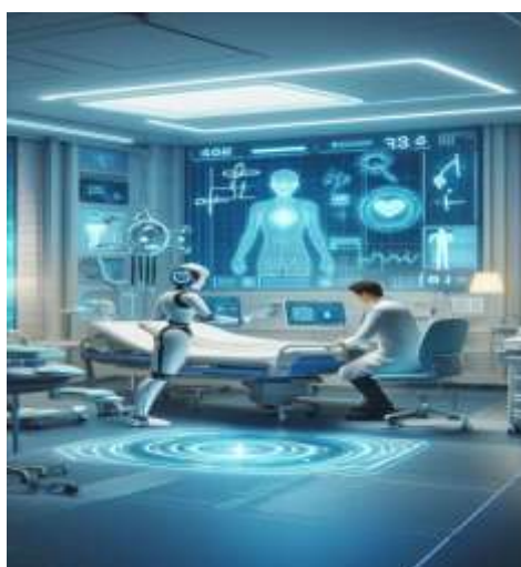
Fig 2: AI in Healthcare