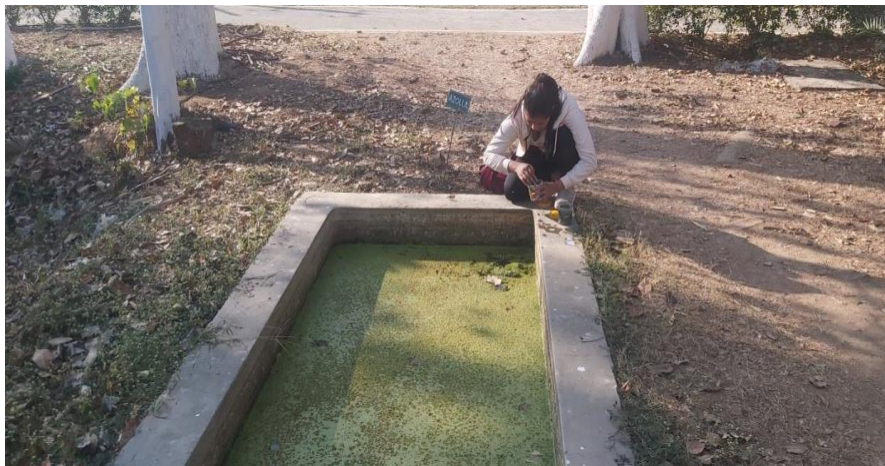
Fig.1. Collection of Azolla pinnata

Plant collection: Whole plant parts of Azolla pinnata were collected from Divyan, Morabadi, Ranchi, Jharkhand.