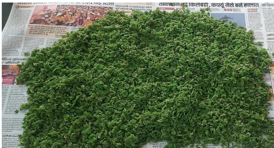
Fig. 2. Drying of Azolla leaves

Preparation of extract: The plant material was washed thoroughly under tap water to remove all the soil particles, mud, dirt from it. After that rinsed it with distilled water. The plant material was allowed to shade dried at room temperature for 3-4 weeks until it was completely dried. The dried material was then grind to made a coarse powder of it using mortar and pestle. The grind sample was subjected to extraction by cold maceration using solvents methanol to obtain extracts. 5gm of powder were added in 50ml of solvent and stirred it occasionally in rotary shaker and kept it for 48hrs, after 2 days the mixture were filtered by using whatman filter paper. After filtration each solvent was allowed to evaporate at room temperature for 18-24hrs to obtain a solid mass. The solid mass which was obtained were also stored in refrigerator at 4°C for further use.