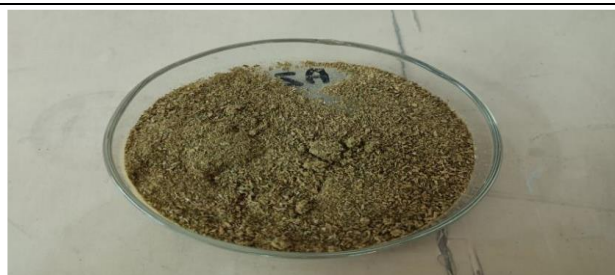
Fig.3. Moisture content