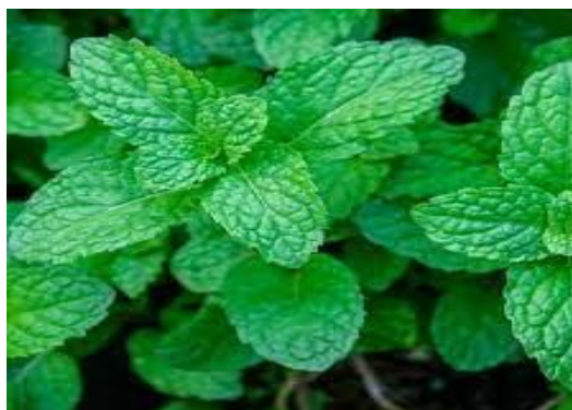
Figure.9 - Mentha plant

Mint ( Mentha ) is one of the aromatic perennial herbs belonging to the Lamiaceae family. It has been used for various applications, such as pharmaceuticals and cosmetics applications. The EO and aqueous extracts of mint potentially have antioxidant properties due to the existence of phenolic compounds. Mint essential oil has been shown to be an effective alternative short-term treatment of irritable bowel syndrome in humans, due to its anti-inflammatory abilities. The antioxidant activity of this plant exclusively relies on its chemical composition and can prevent oxidative stress at the cellular level or in a living organism. Other studies have reported the use of mint extract as an antioxidant and antimicrobial bioactive natural extract. Numerous studies have revealed the inhibitory ability of this plant depending on the type of bacteria and its strong antimicrobial ability against Gram-positive bacteria, especially S. aureus . Other studies have reported that the antimicrobial effect of this plant with different oil concentrations. Mint oil shows strong antimicrobial ability against different bacteria including S. aureus , S. epidermidis , E. coli , Bacillus cereus , Enterococcus faecalis , and Cronobacter sakazakii . This herbal medicine shows inhibitory activity against HSV-1 and HIV viruses.