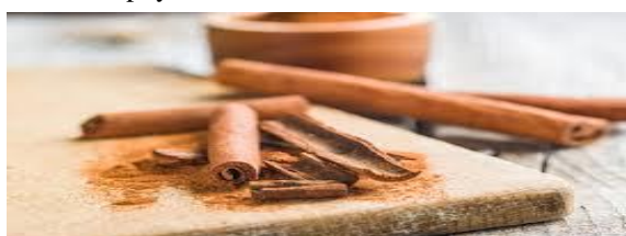
Figure.2 - Cinnamon

Cinnamon ( Cinnamomum verum and Cinnamomum zeylanicum ) is one of the plants that belong to the Lauraceae family. This traditional herbal medicine is from Australia and Asia. Based on the antioxidant, antimicrobial, and anticarcinogenic activities of this plant, it is widely used in medical industries. Previous investigations have found cinnamon to have antimicrobial characteristics. Cinnamon has been traditionally used for its antiseptic, antioxidant, and antimicrobial properties. Previous studies have investigated the antimicrobial activities of cinnamon against various bacteria, such as Bacillus and E. coli . Cinnamon oil has shown antibacterial effects against E. coli , Listeria monocytogenes , Bacillus , Enterococcus faecalis , Salmonella typhimurium , Pseudomonas aeruginosa , Yersinia enterocolitica and Staphylococcus aureus .