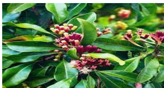
Figure.1 - clove plant

Caryophyllene: A natural compound with anti-inflammatory and antioxidant properties. It is also a common terpene found in various plants.