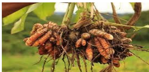
Figure.3 - Turmeric plant

Turmeric ( Curcuma longa ) is one of the herbal medicines used traditionally. It belongs to the Zingiberaceae family. Due to the existence of curcumin (a polyphenolic compound), the extracts of turmeric have shown antimicrobial and antioxidant activity. Therefore, the phenolic compound of curcumin is responsible for its antioxidant activities. The phytochemical structures in turmeric include vitamin C, cineole, tumerone, borneol, zingiberene, d-sabinene, and d-phellandrene. Many types of chemical compounds are found in turmeric including sesquiterpene Ketones, monoterpenes, and sesquiterpene alcohols (e.g., zingiberene). Fresh turmeric contains zingiberene, while the most significant curcuminoid presented in turmeric is curcumin. Previous literature has reported that turmeric has an antimicrobial (antibacterial and antifungal) effect. Curcumin is known for its inhibitory action on microorganisms such as E. coli , S. aureus , Salmonella typhimurium , and Pseudomonas aeruginosa .