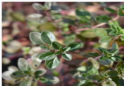
Figure.5 -Thyme Plant

Thyme ( Thymus vulgaris ) is one of the active antimicrobial herbal medicine plants which belong to the Lamiaceae family. It is more active against different bacteria and can inhibit the growth of bacteria such as Lactobacillus plantarum , Brochothrix thermosphacta , and Brevibacterium linens . This potent antimicrobial ability is related to the presence of high concentrations of carvacrol, thymol, and phenols in the extracts and essential oils of thyme. Thyme extracts and essential oil have demonstrated a long list of medicinal properties, such as antibacterial, antioxidant, antitussive, spasmolytic, anticancer, and anti-inflammatory characteristics. The extract of this plant has been traditionally used as an antitumor medicine due to its antioxidant property. Numerous studies in the literature have demonstrated that the higher phenolic content of thyme is responsible for the high radical scavenging and antioxidant properties of this medicinal plant.