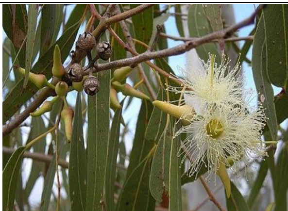
Figure.7 - Eucalyptus Plant