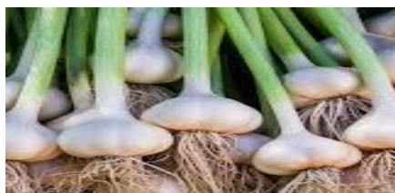
Figure. 6- Garlic

Garlic ( Allium sativum ) is an herbal medicine belonging to the Amaryllidaceae family. Garlic is native to Central Asia, especially Iran. Garlic has been demonstrated to possess biological activities including antioxidant, immunomodulatory activities, antidiabetic, anticancer, antibacterial, cardio protective and anti-inflammatory effects. The major components of garlic are phenolic, polysaccharides, and organosulfur contents. It also contains saponins, amino acid, flavonoids, vitamins A and C, B-complex vitamins, and minerals. These chemical components are the reason for the biological activity of garlic. Garlic has been known as a natural antioxidant and can inhibit the harmful effects of free radicals in cells. Antioxidant materials are naturally found in different plants and can neutralize free radicals through electron donation and by converting these harmful molecules to harmless products. Garlic is one of the traditional medicines with antimicrobial and antioxidant characteristics. Garlic was demonstrated to exhibit antibacterial activity against a varied range of different bacteria (Gram-positive and Gram-negative) such as Klebsiella , Enterococcus faecalis , Pseudomonas , Salmonella typhi , Proteus , Staphylococcus aureus , and Escherichia coli