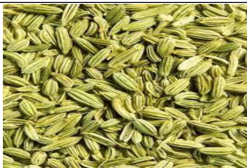
Figure.8 - fennel Plant