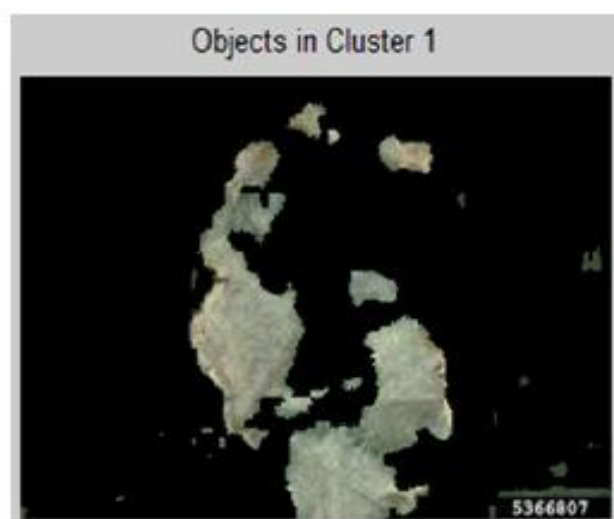
Figure. 3 Disease affected area obtained by K means clustering.