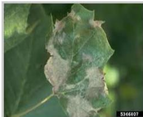
Figure 2 Disease affected leaf

k means makes use of an iterative set of rules that minimizes the sum of distances from each item to its cluster centroid, over all clusters that have been created. This algorithm moves items in among clusters until the sum can not be decreased any similarly. The result is a set of clusters which are as compacted and are well-separated as a ways as possible. you will manipulate the details of the minimization the use of several non-obligatory input parameters to kmeans clusters, which includes ones for the initial values of the cluster centroids, and for the most wide variety of iterations. by way of default and by way of preference, kmeans makes use of the k-means algorithm for cluster middle initialization and the squared Euclidean distance metric to determine distances. however, Kmeans clustering is used to partition the leaf image into 3 or extra clusters in which one or greater clusters comprise the sickness in case while the leaf is infected by means of more than one ailment. In our implementation a couple of values of variety of clusters had been tested. best outcomes had been received whilst the range of clusters become both three or 4.