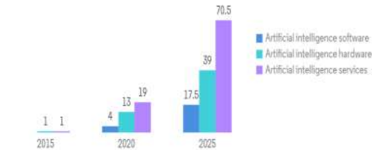
Revenues from the Artificial Intelligence (AI) Market from 2015 to 2025, by Segment, in USD in Billion

Source: Bank of America (Bank of America Merrill Lynch)