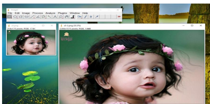
Figure 3: Bicubic Interpolation of Image.