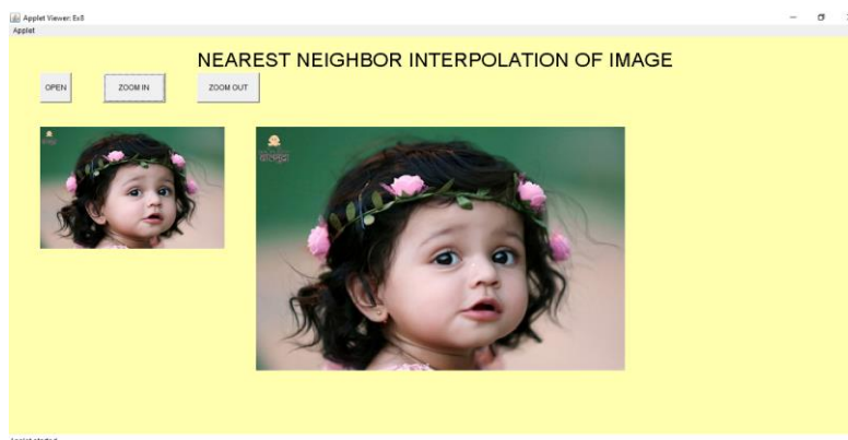
Figure 1: Nearest Neighbor Interpolation of Image.