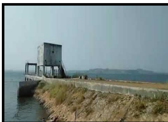
Fig.2 Selud pump house