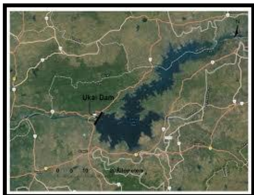
Fig.1 Map showing study area

The selected sites for carrying out the present study were the Selud pump house, Thuti of the Ukai Reservoir catchment area and Navi Ukai. Selud and Thuti are a village in Uchchhal Taluka in Surat district of Gujarat State. Thuti is located on the bank of river Tapi. It is located 92km east of the district headquarters in Surat. Navi Ukai is a small village in Songadh Taluka in Surat district of Gujarat State. It is located 80km east of the district headquarters in Surat. Navi Ukai is located on the bank of river Tapi and is considered a good source for a variety of freshwater fishes. The map of the study area is depicted in Fig. 1. The selected sites are Fig2,3 &4.