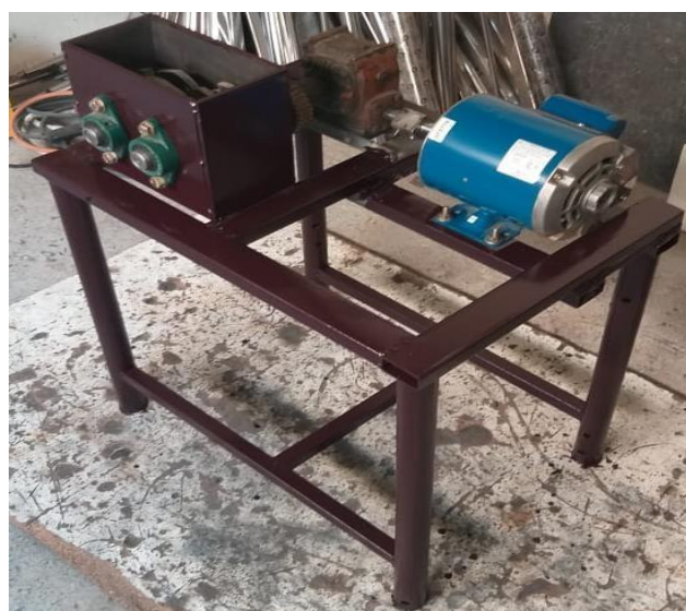
Figure 2: Fabricated Machine