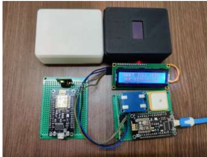
Figure 2: Proof of Concept

We can see the practical implementation and working of the hardware.