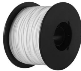
Fig.1 Bobbin of PLA material

The material used for manufacturing of emergency door locks is Polylactic Acid, which is, in short, written as PLA. It is a thermoplastic derived from renewable, organic sources such as corn starch or sugar cane. Using biomass resources makes PLA production different from most plastics, which are produced using fossil fuels through the distillation and polymerization of petroleum. PLA material is wound on a bobbin which is represented in fig.1.