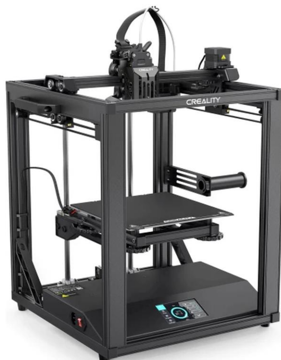
Fig.4 An Additive Manufacturing Machine

The machine utilized for the emergency door lock is represented in Fig. 4. This machine is an Additive Manufacturing Machine.