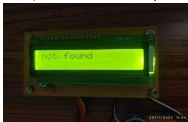
Fig. 2 Not Found (Vote will not be accepted)