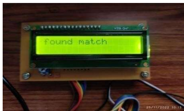
Fig. 1 Found Match (vote will be accepted)