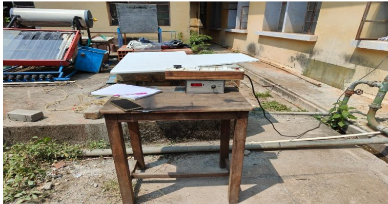
Figure 1: Experimental setup.