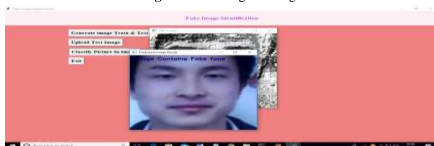
Fig 4.2 classification of image

From above image we can assume if we upload an image the it will display that image is original or duplicate.