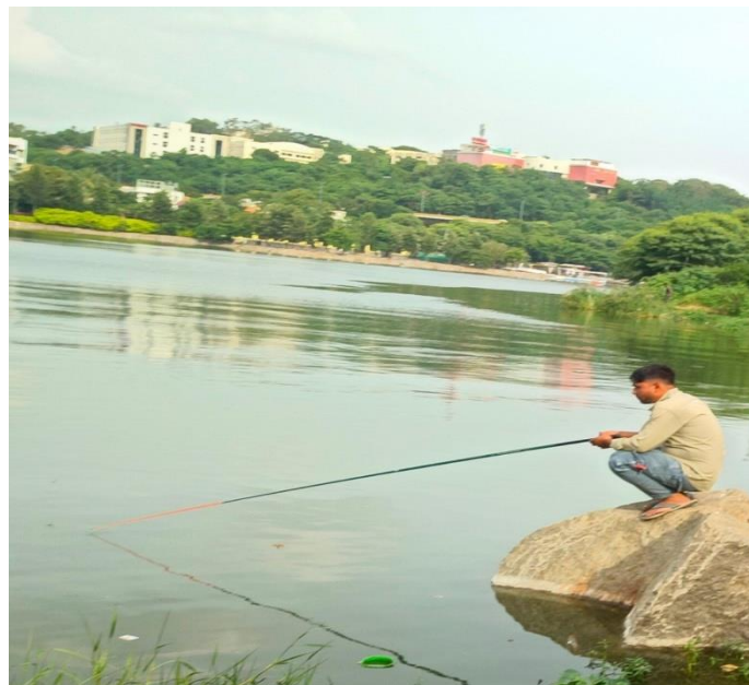
Figure 3: Collecting fish with fishing rod

By employing effective fishing methods and proper sample preservation techniques, researchers can collect live fish specimens from Durgam Cheruvu for analysis, allowing them to assess the impact of heavy metals on the fish population and the overall ecosystem of the lake.