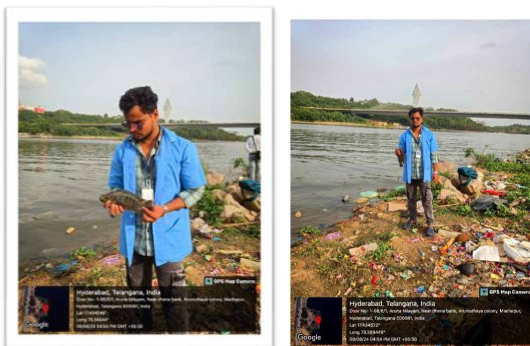
Figure 4,5: Fish sample collected at Durgam Cheruvu

Sampling fish like tilapia, especially when measuring for a specific length like 42 cm, involves a series of steps to ensure accurate and reliable data. Here's a guide on how to conduct field sampling for tilapia: