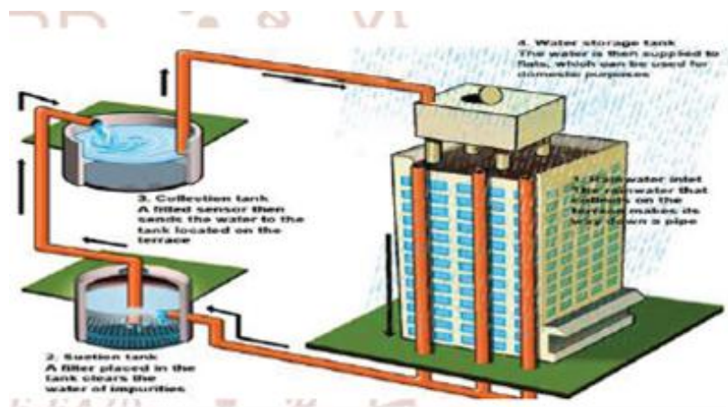
Figure 1: Rainwater harvesting system.

As per (Singh Shishu Pal, 2018) the rainwater harvesting system is simple and easiest method to install in houses and buildings. Family water need is achived by installation of RWHS. The city of Bangalore in India, the residential buildings store rainwater can use for both dry and wet seasons. The advantages explained are it is easy to maintain, reduces water bills, it is suitable for irrigation, Reduces demand on ground water, can be used for various non drinking purpose .the disadvantages are rainfall are sometimes unpredictable sometimes there is more rainfall or no rainfall, the initial installation of cost is high, it needs regular maintenance, typology of roof may result in seeping of chemical and animal dropping and there is limitation for storage.