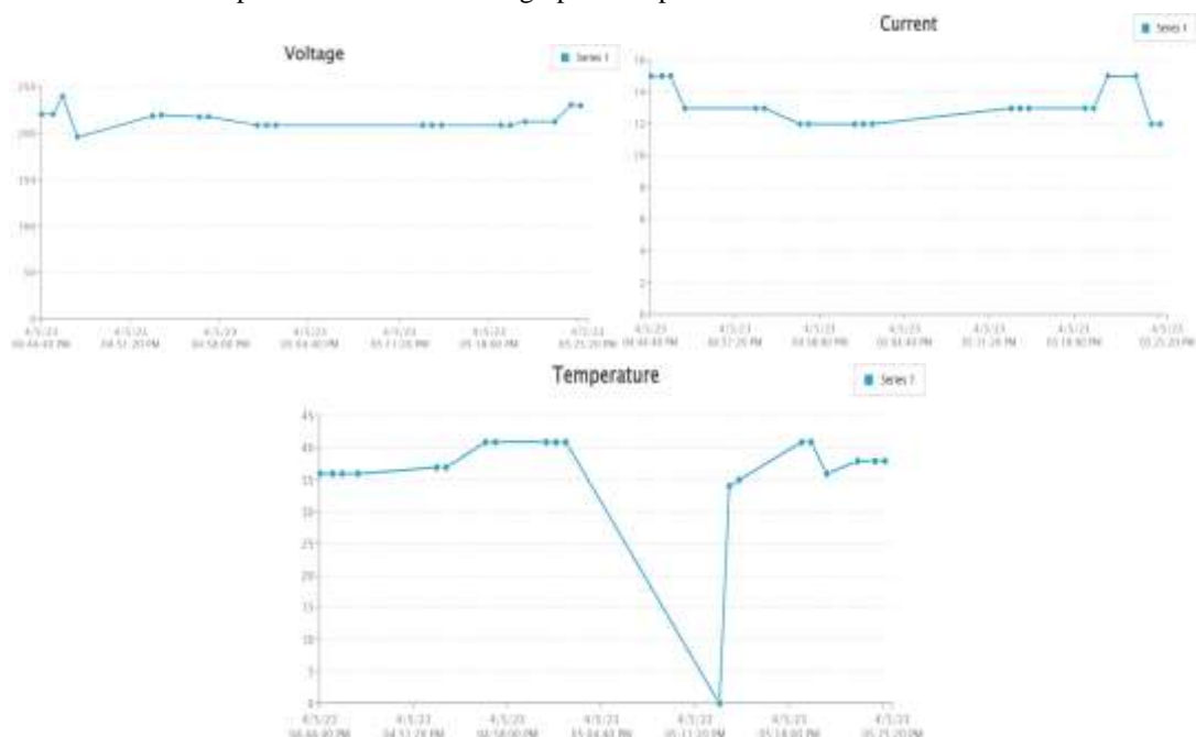
Figure 4: Thing speak showing data upload data in charts.

Below is the data which is uploaded to the server in graphical representation.