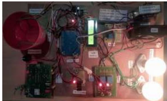
Figure 3: prototype

The cloud used in this is named Thing speak, which is again an open-source platform from the makers of MATLAB and Simulink. The data is stored, and the graphical representation is also done. The stored data is available for download in three different formats. JSON,.XML,.CSV. The representation of cloud data interface is shown in the picture below. Below is the pictorial representation of the hardware prototype we have developed.