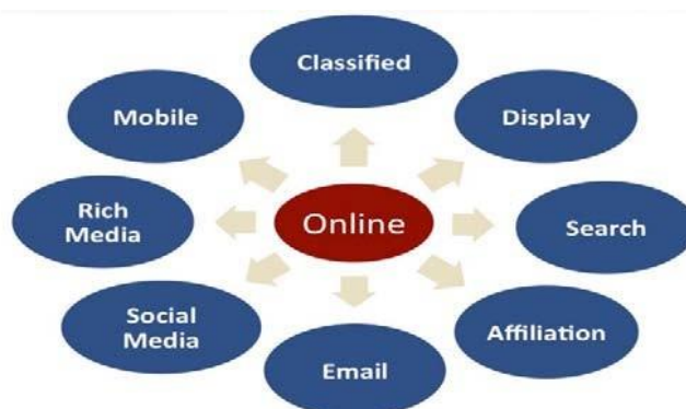
Fig 1: Online Advertising