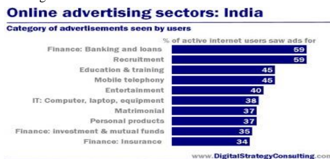
Fig 4: Indian Online Advertising Sectors

http://www.digitalstrategyconsulting.com