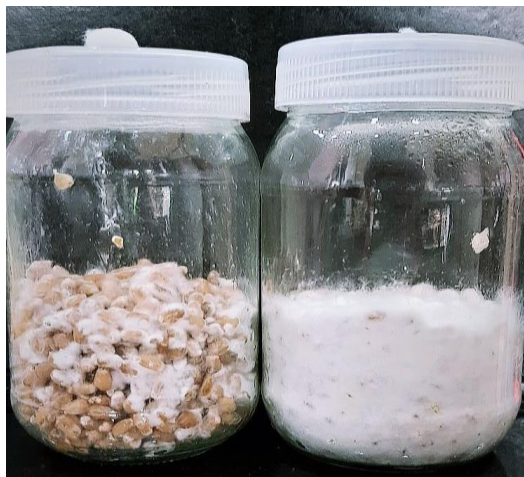
Figure 1: Jar 1 showing mycelial coverage inoculated with solid inoculum and jar 2 showing mycelial coverage inoculated with liquid inoculum

culture conditions are more conducive to the proliferation of Ganoderma lucidum mycelia. This result interpreted that liquid culture spread evenly in the substrate, hence showing faster mycelial growth as compared to solid culture and also minimizing the chances of substrate contamination as the solid culture sticks to a place and the mycelium takes time to cover the substrate.