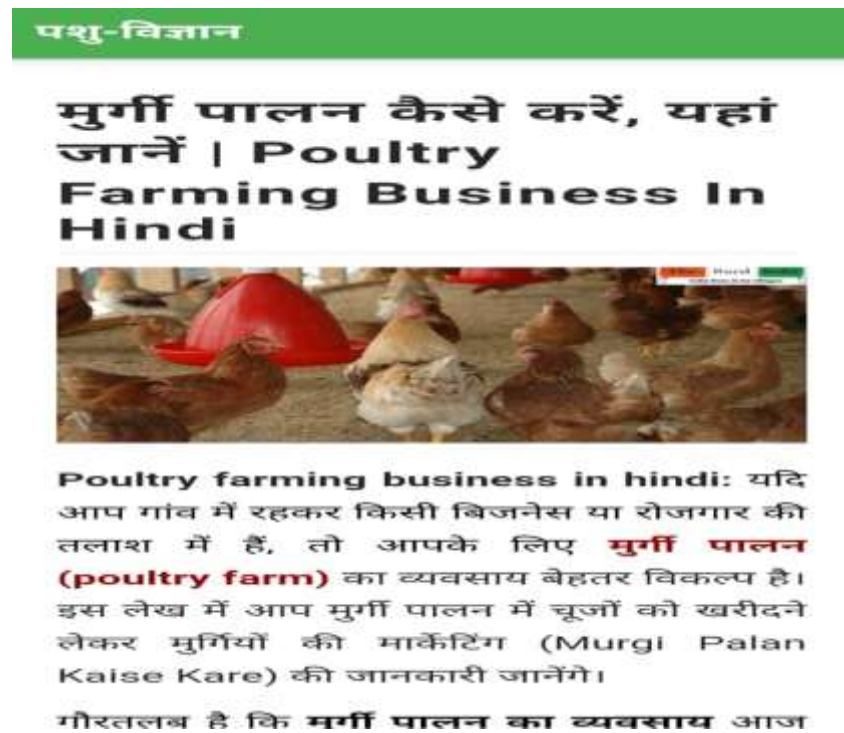
Figure 4.4: Snapshot.