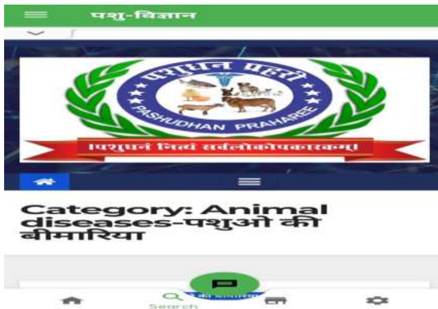
Figure 4.3: Snapshot.