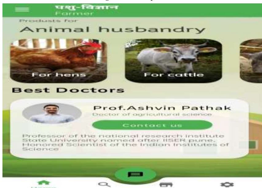
Figure 4.2: Snapshot.