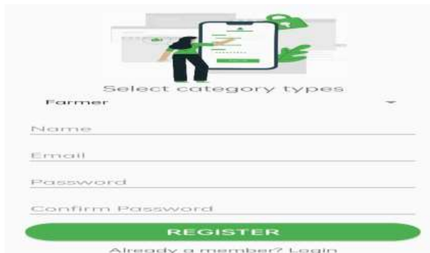
Figure 4.1: Snapshot.