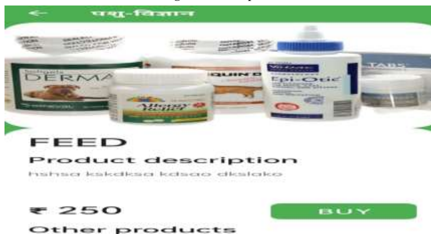
Figure 4.5: Snapshot.