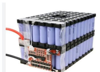
Figure 2: BATTERY