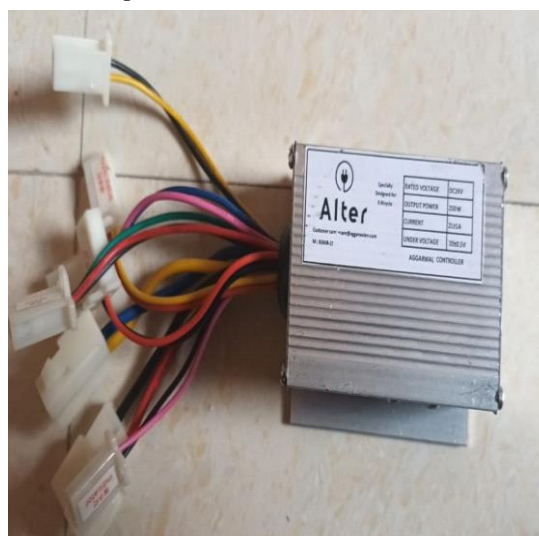
Figure 4: CONTROLLER

There are mainly two types of controllers which are designed to be effective on two types of motor, one is brushed, and another is brushless. According to the motor in use the controller function also varies. Brushless motors are popular nowadays because of high efficiency and durability, and it is also supported by the reduced cost factors, whereas brushed motors because of less complex controller mechanism, is still in use fairly.