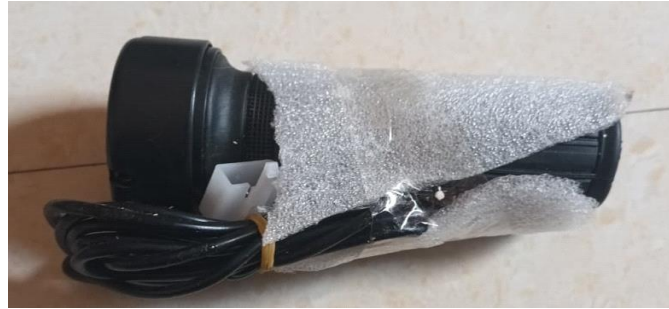
Figure 7: THROTTLE

The concept is pretty much the same as in a common motorcycle. These allow to directly control the amount of power that the motor is producing in real-time. There are several types, as thumb throttles (the throttle is engaged by pushing the lever forward with your thumb), full twist throttles (the throttle is engaged by twisting the throttle grip, seen in most motorcycles) or half twist throttles (the throttle is engaged by twisting the throttle grip, which is this case is just half of the grip).