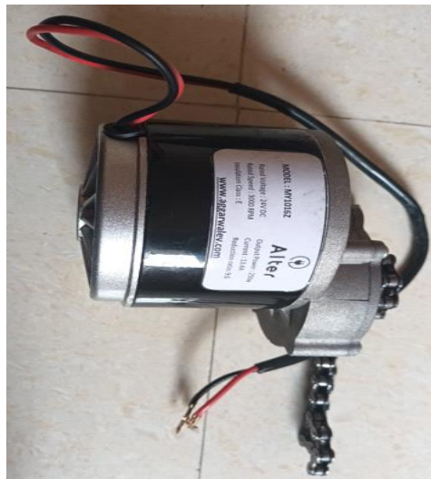
Figure 5: MOTOR

How Motors Work: Motor is made up of skilful wrapping of coils on a stator, a rotor for the rotation, and magnets to influence the rotations. The magnets used their work electromagnetically. That means electricity influences this iron to behave like a magnet, having both attraction and repulsion characteristics of a magnet into this, thereby helping it to generate the motion accompanying this. The principle in this is to switch the direction of the forces to keep the motor to move continuously, once it is started until the time it is stopped.