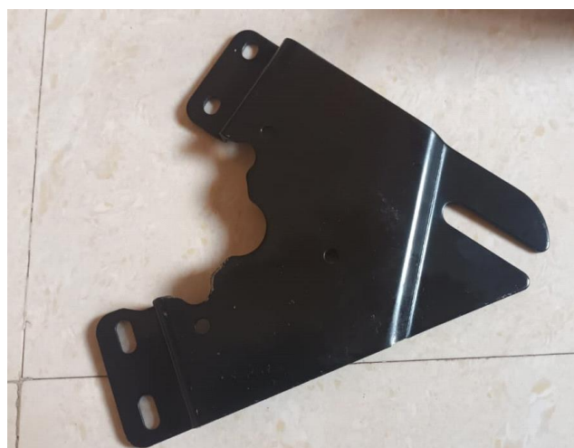
Figure 6: SUPPORT