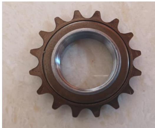
Figure 8: GEAR

Spur gears are a cylindrical shaped toothed component used in industrial equipment to transfer mechanical motion as well as control speed, power, and torque. These simple gears are cost-effective, durable, and reliable and provide a positive, constant speed drive to facilitate daily industrial operations. For Transfer Mechanical motion as well as Control Speed, Power and Torque. Its Operate by Chain.