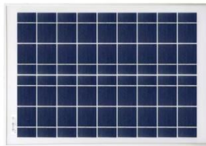
Fig-3 (A) SOLAR PANEL

A solar panel of 20W is specifically designed for powering small electrical items or devices. Some common devices that a 20W panel can power are cell phones, digital and security cameras, and lights. Besides, such a type of solar panel is also suitable for use on the go, such as when you are camping. Solar power is clean & sustainable energy. A 20 watt solar panel is one of the most innovative options to use solar power when you're travelling.