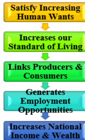
Fig 2: Importance of Commerce Education