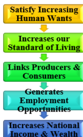
Fig 2: Importance of Commerce Education