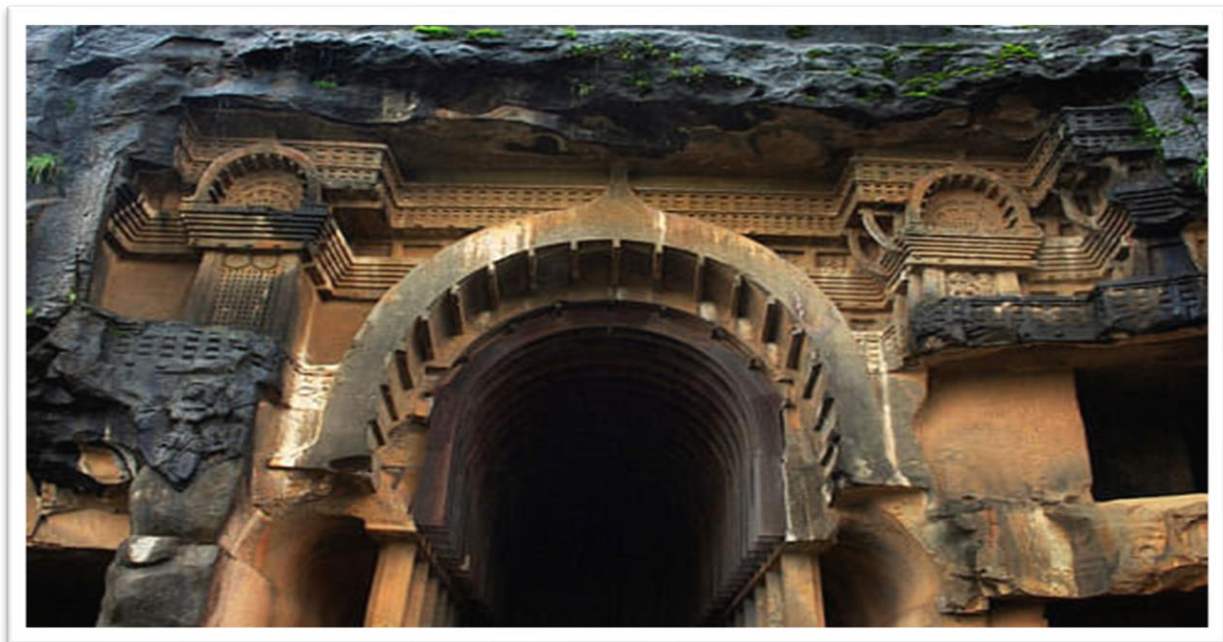
Karla and Bhaja Caves

(Source https://spiritedblogger.com/travel/kass-pathar-satara-the-valley-of-flowers-best-season-to-visit/ )