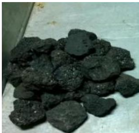
Figure 1: Steel Slag Sample

Steel slag is a byproduct obtained either from conversion of iron to steel in a Basic Oxygen Furnace (BOF), or by the melting of scrap to make steel in the Electric Arc Furnace (EAF). The molten liquid is a complex solution of silicates and oxides that solidifies on cooling and forms steel slag. Steel slag is defined by the American Society for Testing and Materials (ASTM) as a non-metallic product, consisting essentially of calcium silicates and ferrites combined with fused oxides of iron, aluminum, manganese, calcium and magnesium that are developed simultaneously with steel in basic oxygen, electric arc, or open hearth furnaces.