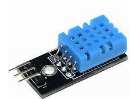
Figure D: Temperature and humidity Sensor (DTH 11)

Temperature and Humidity sensor : The temperature sensor in the system will continuously monitor the ambient temperature of the room or barn where the cows are housed. Once the temperature exceeds 40°C, the sensor will detect this increase and immediately trigger the fogger system. This is achieved by programming the system to automatically activate when the sensor registers a temperature threshold of 40°C or higher.