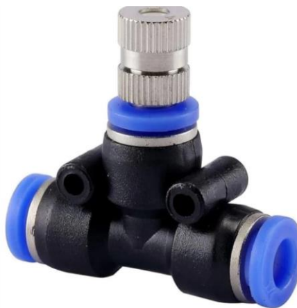
Figure F: Fogger Device or Mist device

In this setup, the fogger is activated automatically when the temperature sensor detects a temperature exceeding 40°C.