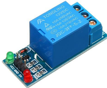
Figure E: Relay Module

high-pressure pump or fogger. The relay allows the Arduino to control high-power devices like the fogger using a low-power signal. When the temperature drops below the set point, the relay turns off the fogger, stopping the cooling process.