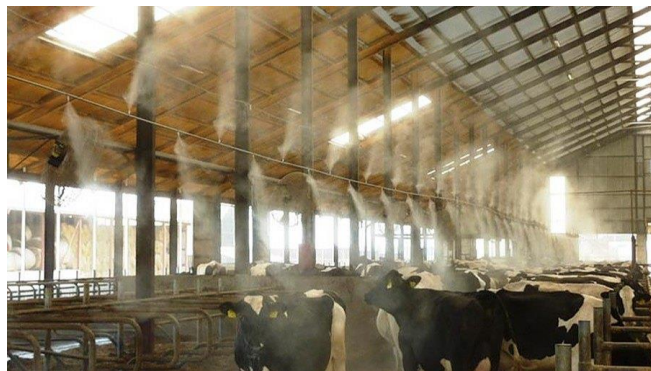
Figure G: Fogger system Applied in a dairy farm

3.4. However, some weaknesses and factors for the fogger systems exist: