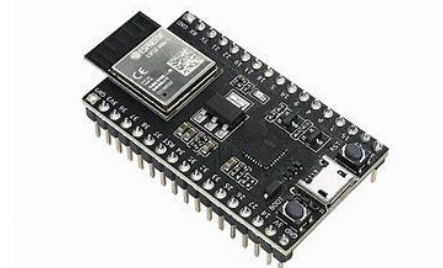
Figure C: ESP 32 Node MCU

The operator can also manually turn the fogger on or off and monitor the system's status remotely, ensuring easy management and efficient operation of the cooling system for the cow.