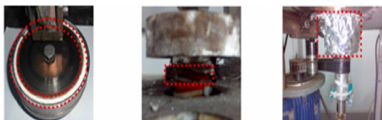
Fig. 3. Experimental setup of the wear