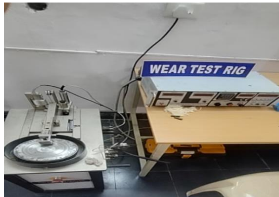
Fig. 4. Wear Test Rig.