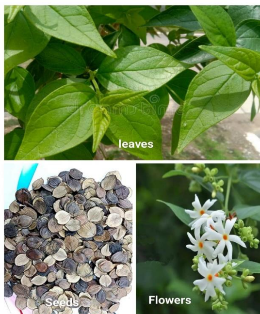
Fig. 1.1 Parts of Nyctanthus arbor-tristis

Part used:- Apart from whole plant Leaves, bark, root, seed, flower are also used.