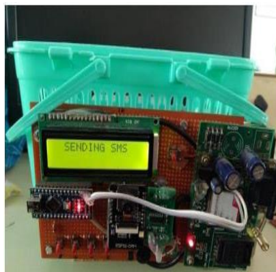
Figure 3: Hardware

As items are added to the cart, the weight sensors and RFID readers identify them automatically, updating the total cost. The cart can provide directions to products based on a user's shopping list, helping shoppers find items efficiently. Promotions and Recommendations: The cart can suggest deals or complementary items based on what's already in the cart or a shopper's purchase history. A QR code (Quick Response code) on a product is a matrix barcode that can be scanned using a smartphone or QR code reader. Additionally, businesses can track how many times a QR code has been scanned, offering insights into customer behavior and the effectiveness of marketing campaigns. Overall, QR codes improve the user experience by providing quick access to information and services directly from the product.