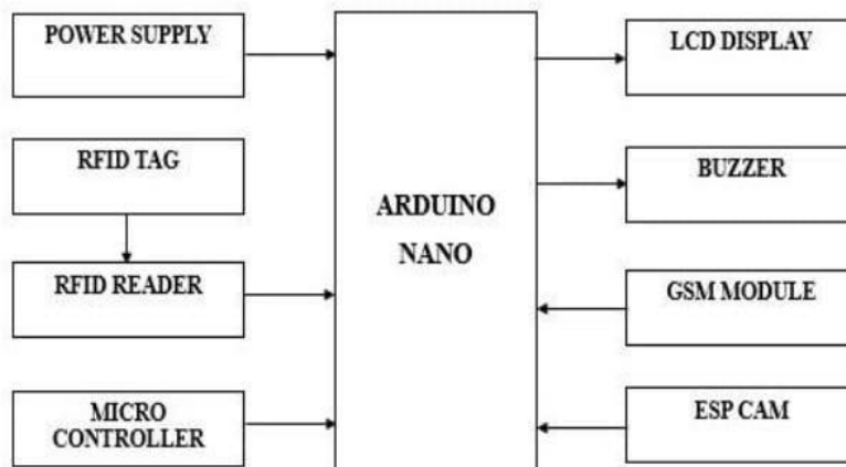
Figure 1:Block diagram

It Consists of Arduino NANO ,1 barcode scanner,100V battery kit,16*2 LCD display, RFID tag, RFID reader, Microcontroller, GSM Module, ESP cam, buzzer and customized basket. The Automated Shopping cart system integrates a Shopping cart (trolley) with two sets of barcode scanners placed at two different checkpoints the entry and exit points respectively. Wrongful entries can be corrected by making use of a that changes the functionality of the machine from addition of products to removal of products and activates the other barcode scanner at the opposite end. A wireless smart device makes note of all the scanned commodities of the particular trolley and is with the supermarket's backend database which contains details of the products such as cost price, reducing and transmitted to the Shop's central billing program. The tray in which the two barcode scanners are embedded is fitted with a lock and keys for which are with the people at the billing section