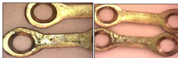
Figure 1: Topographical analysis: Stereo-Zoom microscopic images of Ti implants

Uniform homogenous coating of the drugs and carriers on the surface of the Titanium were topographically analyzed using a stereo-zoom microscope. In Fig.1, uniform surface coating of the drug and carrier mixtures were clearly observed and the same was also compared with the uncoated titanium. Homogenous coating of the drug-carrier mixture influenced the antibacterial activity of Titanium that was tested under in vitro condition. Colour of the coated materials changed due to the addition of drugs and carriers. Colour change indicated homogenous coating of drugs and carriers on the material surface.