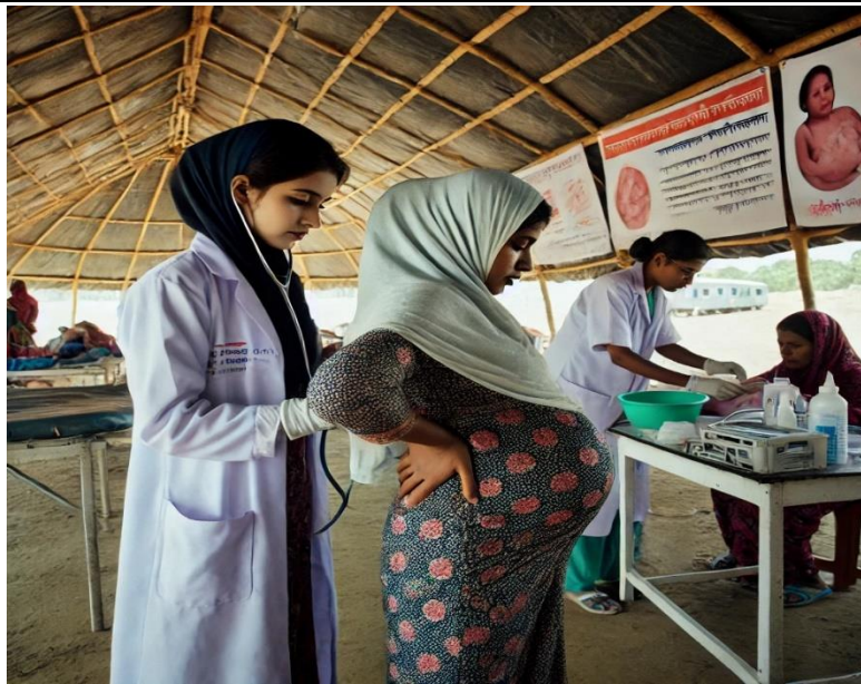
Photo: A healthcare worker assists a pregnant woman in a maternal health center in a Rohingya camp in Cox's Bazar, underscoring the need for maternal healthcare