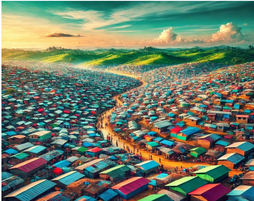
Photo: An aerial view of Rohingya camps in Cox's Bazar, highlighting the scale of the crisis