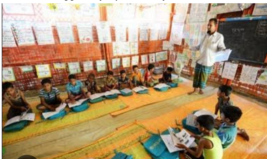
Photo: Rohingya children attending class in a makeshift classroom at a Rohingya camp in Cox's Bazar. Limited access to education remains a significant challenge, particularly for girls

Additionally, livelihood initiatives that frequently give preference to men or neglect to meet the unique requirements of women, such as childcare and mobility, exclude refugee women. Women continue to rely on humanitarian assistance as a result, which impedes both their independence and the healing of the larger society. In the context of refugees, removing these obstacles is crucial to advancing gender equality, women's empowerment, and sustainable development.