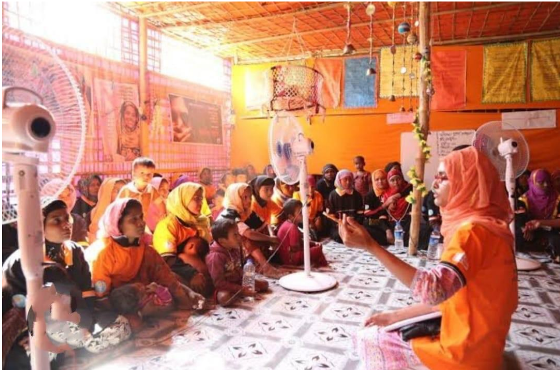
Photo: A photo of women gathering in a women friendly space in Rohingya camp of Cox's Bazar