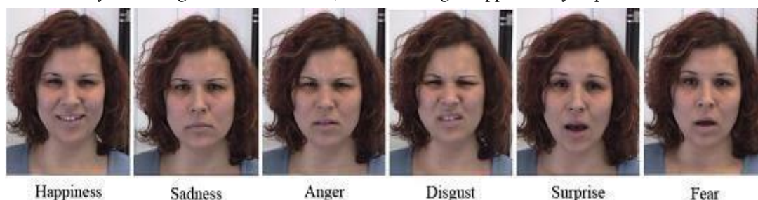
Figure 1.: Six Universal Emotions