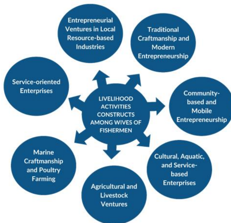
Figure 2. Livelihood Activities Constructs Framework among Wives of Fishermen

Presented in Figure 2 is the framework developed based on the findings. The researchers found that the factors of the Livelihood activities constructed among wives of fishermen are (1.) Entrepreneurial Ventures in Local Resource-based Industries, (2) Traditional Craftmanship and Modern Entrepreneurship, (3) Community-based and Mobile Entrepreneurship, (4) Cultural, Aquatic, and Service-based Enterprises, (5) Agricultural and Livestock Ventures, (6) Marine Craftmanship and Poultry Farming, and (7) Service-oriented Enterprises