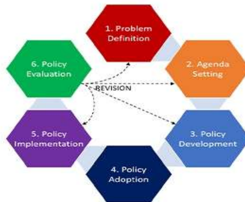
Fig 1. Role of Information Technology in Public Policy Formulation and Implementation