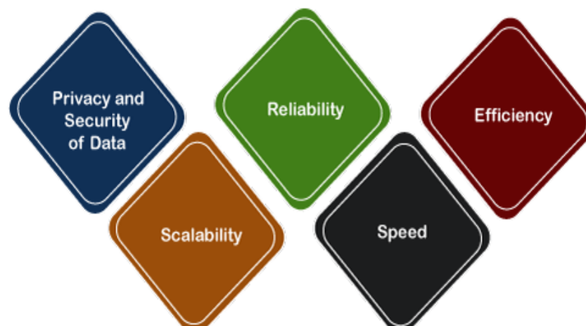
Figure 2: Challenges in Edge Computing