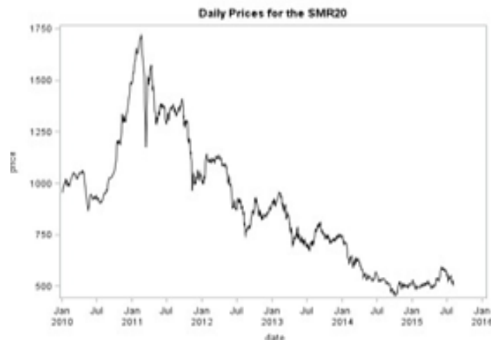
FIGURE 2: Daily Prices For The Smr20

In (left panel) there is a clear trend of 1367 daily observations prices of the S.M.R 20 in Malaysia from 4th January 2010 to 4th August 2015. When daily prices converted to log returns, the plot in (right panel) illustrates there are large negative values especially on March and October 2011.