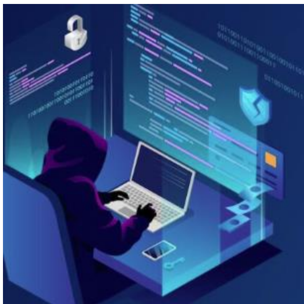
FIGURE 1: Identifying And Preventing Hacking Breaches

Investigate the Cybercrime Underground Economy Emphasize the closed community nature of the cybercrime underground. Collect Data Relevant to the Cybercrime Underground. Consider what data is needed and where it can be obtained. Collect data from the cybercrime underground community. Obtain malware-related data from a leading global cyber security research firm. Emphasize the importance of Remote Access Trojans (RATs). Integrate RAT elements into all steps (Steps 1-4) of the framework. Model hacking breach incident interarrival times and breach sizes. Utilize ARMA-GARCH models to describe the evolution of hacking breaches. Stress the use of stochastic processes over distributions. Consider dependence for accurate prediction results in inter-arrival times and breach sizes. A comprehensive approach covering all phases of data analysis. Emphasis on RATs throughout the process. Integration of data collection, modeling, and application development. Develop an application based on the analytical methods. Implement the application to facilitate the investigation of the cybercrime underground. Ensure the application incorporates RAT-based definitions and insights gained from the data analysis.