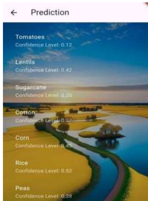
Figure 2: Page displaying types of crops to be cultivated.