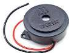
Fig 2. Buzzer

A buzzer is an audio device that produces sound from an electrical signal. They are also called sounders, audio indicators, or audio alarms. An audio signaling device like a beeper or buzzer may be electromechanical or piezoelectric or mechanical type. The main function of this is to convert the signal from audio to sound.