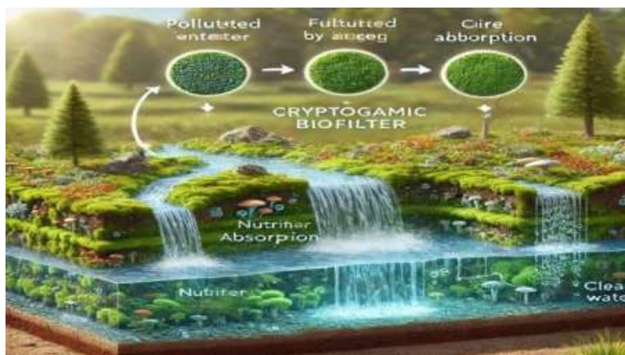
Fig 4. Cryptogamic Biofilter

The cryptogamic biofilter process involves using cryptogamic covers—composed of mosses, lichens, algae, and cyanobacteria—to filter and purify water. These organisms are known for their ability to absorb pollutants, stabilize ecosystems, and support sustainable water treatment. Below is the step-by-step process: