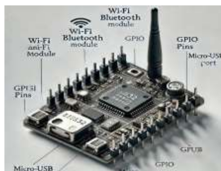
Fig 3. ESP32 Microcontroller

The ESP32 is a follow-up to the ESP8266. This low-cost system on a chip (SoC) series was created by Espressif Systems. Based on its value for the price, small size, and relatively low power consumption, the ESP32 is well-suited to a number of different IoT applications. ESP32 can perform as a complete standalone system or as a slave device to a host MCU, reducing communication stack overhead on the main application processor. ESP32 can interface with other systems to provide Wi-Fi and Bluetooth functionality through its SPI / SDIO or I2C/UART interfaces.