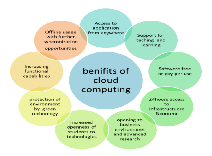
Fig 2 - Benefits of cloud computing