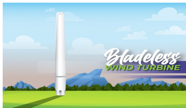
Fig 3: Bladeless Wind Turbines

Overall, the results of this study support the continued research and development of bladeless wind turbine technology, emphasizing the need for further innovation, scalability, and cost optimization to enable widespread commercial adoption. With ongoing advancements and collaborative efforts, bladeless turbines hold great promise for expanding the reach and impact of wind energy generation in the global transition towards a low-carbon future.