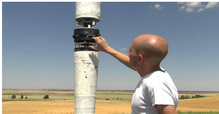
Fig 2: No blades! A pole-shaped wind turbine

The proposed methodology aims to provide a systematic and comprehensive investigation of bladeless wind turbine technology, incorporating computational model experimental testing, and economic analysis to assess its performance, feasibility, and potential for widespread adoption in the renewable energy sector.