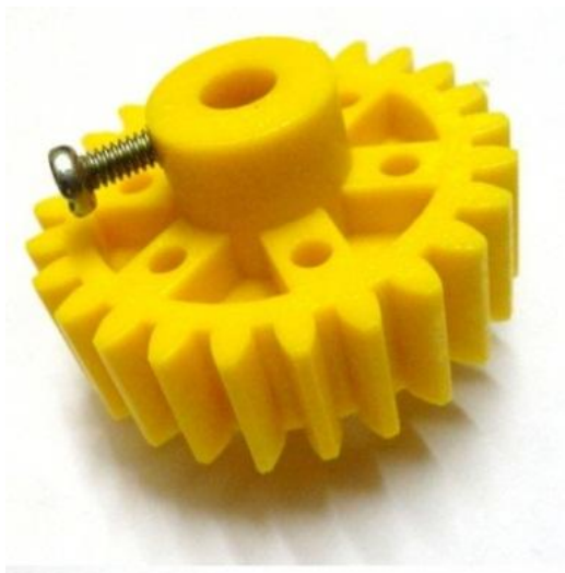
Fig.9. Spur Gear.