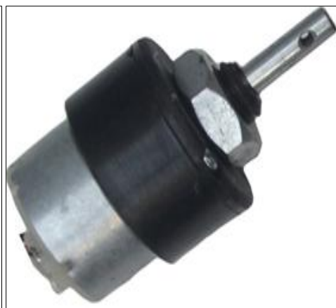
Fig.4. DC Motors.