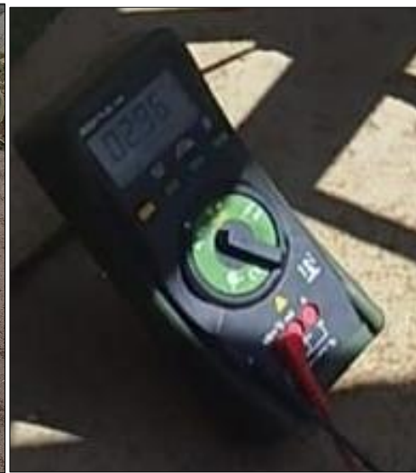
Reading Of Wind Energy