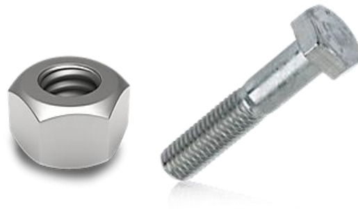
Fig.8. Nut and Bolt