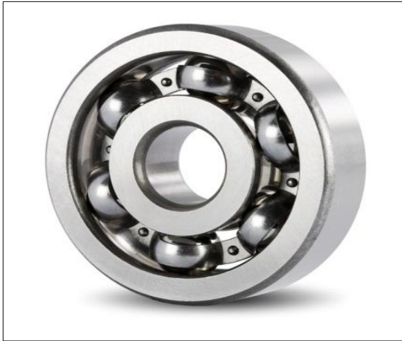
Fig.5. Pedestal bearing.