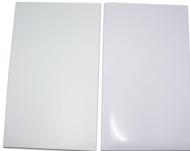
Fig.10. Wild mill blade.

Solar strength is power from the Sun. It is renewable, inexhaustible and environmental pollutants unfurnished. Solar charged battery structures offer strength supply for entire 24hours an afternoon no matter horrific climate. More so, electricity screw ups or energy fluctuations due to provider a part of restore as the case may be is nonexistent. Wind is a herbal phenomenon related to the motion of air loads caused more often than not by way of the differential solar heating of the earth's floor.