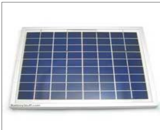
Fig.1. Solar panel.