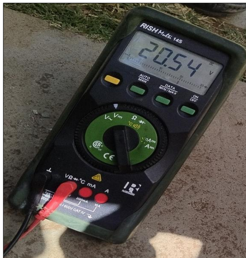
Reading Of Solar Pannel