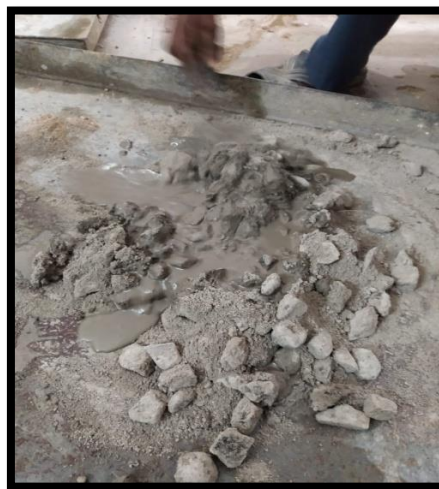
Fig. 3 Mixing with adding water gradually