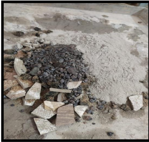
Fig. 1 Mixing of Ingredients

and CA respectively. First, prepare the dry mix by mixing for about 2 minutes. Afterward, water is incrementally introduced into the mixture and mixed for an additional two minutes. When SS and crushed ceramic tiles are incorporated together, the mixing duration progressively increases.