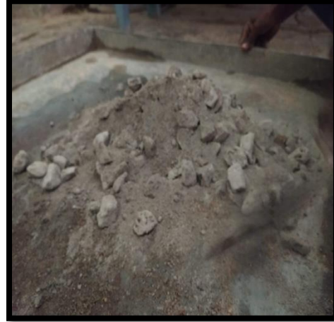
Fig. 2 Dry mixing of concrete