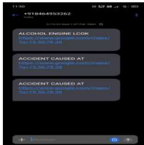
Figure 6: message received by the specified phone number

When the accelerometer is shaken abnormally, i.e., in case of an accident when there is an abrupt change of axis, SMS is sent to the mobile number mentioned in the code and the latitude and longitude is also sent in the form of Google maps. The message is received in the specified mobile number along with the specific location.