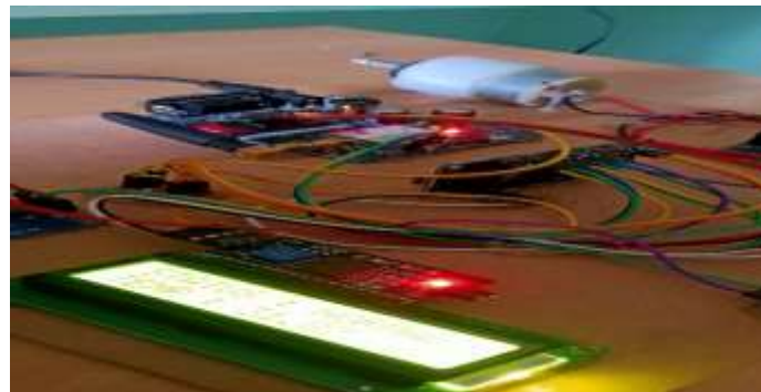
Figure 5: After receiving GPS signal, the latitude and longitude of the current position of the vehicle is displayed.

After receiving GPS signal, the latitude and longitude of the current position of the vehicle is displayed, also the speed is displayed in knots.