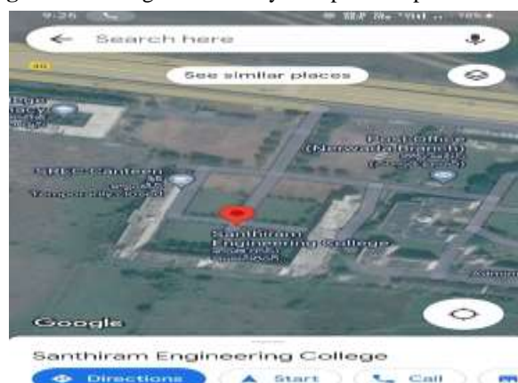
Figure 7: Location of the accident sent via Google Map.