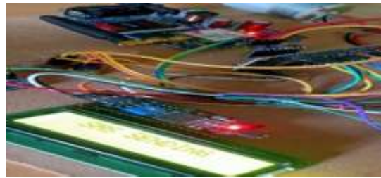
Figure 4: The successful initialization of the system is displayed in the LCD

After receiving GPS signal, the latitude and longitude of the current position of the vehicle is displayed, also the speed is displayed in knots.