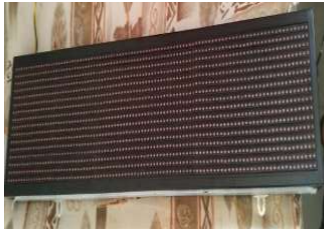
Figure 3: Hardware