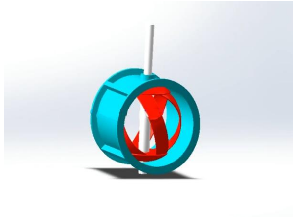
Fig3. 3D printed sample model of turbine