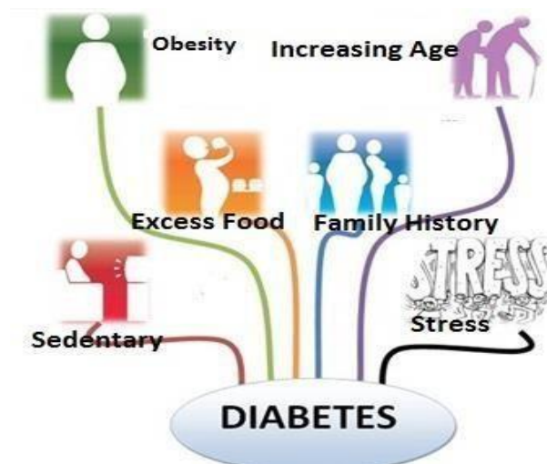
Fig1: Reason for diabetes

Public attention campaigns emphasize prominence of early detection, lifestyle modifications, and everyday fitness check-ups.