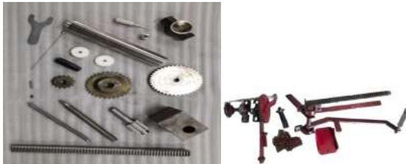
Fig no. 2: Cutting arrangement