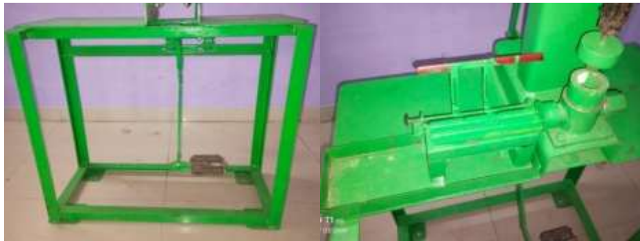
Fig no. 1: Frame for Machine