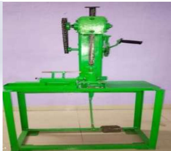
Fig No: 5 Fabricated Incense Products Machine