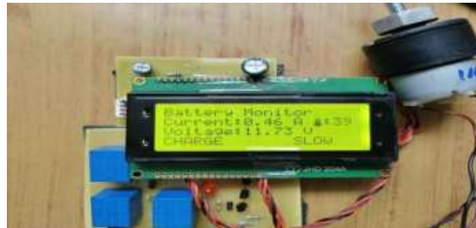
Fig.5 DISPLAY OF BATTERY WHILE SLOW CHARGING

Since it is generally recommended to charge below half the capacity, or 0.5c, for safe charging, it could be wise to install an additional CC or CV regulator to control the amount of current during charge.