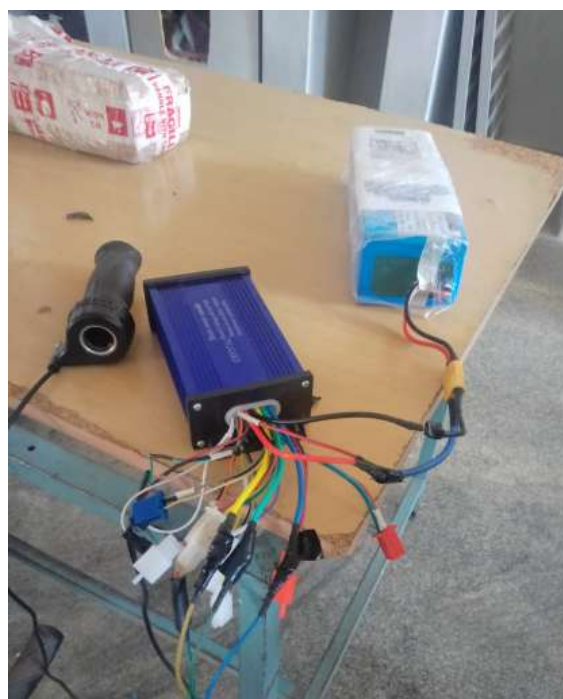
Fig. 7 BMS WITH CONTROLLER CONNECTION