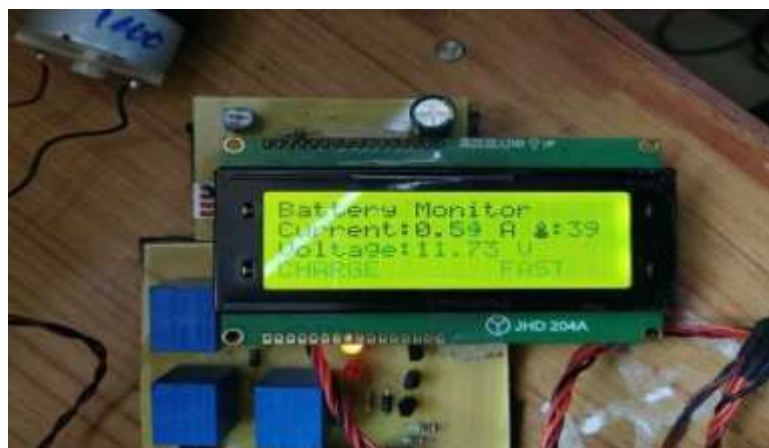
Fig. 6 DISPLAY OF BATTERY WHILE FAST CHARGING