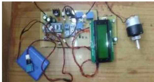
Fig.4 Control Circuit Connections

The charging procedure is carried out by selecting the charge option using the push buttons attached to the STM32 Micro-Controller's B12, B13, B14, and B15 pins, as illustrated in Fig. 4.